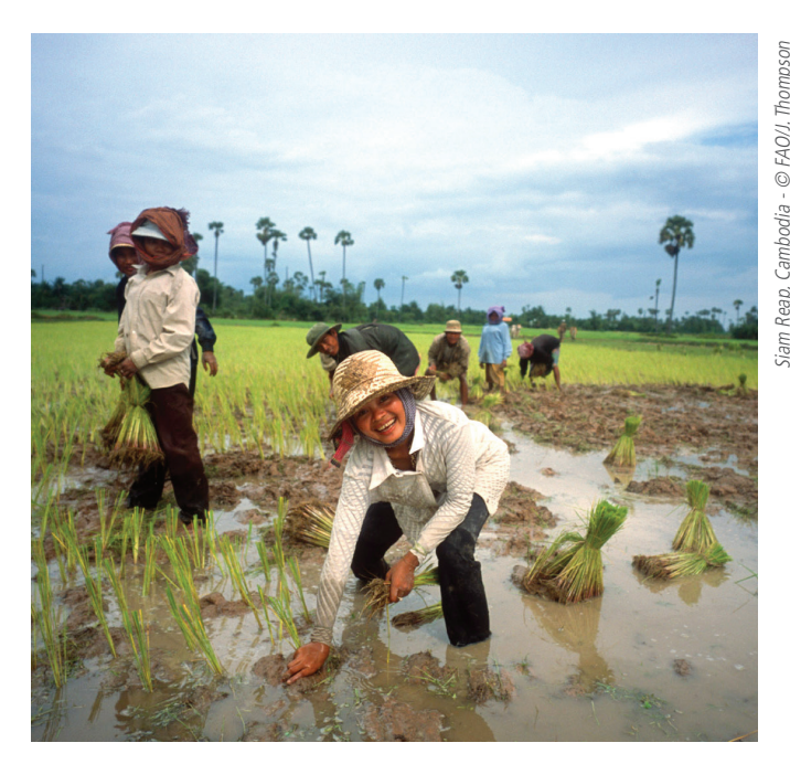
The government has paid special attention to the rice sector, the dominant crop in Cambodia. Rice occupies more than 80 percent of cultivated land and is a key export commodity. As the staple of the traditional diet, rice provides more than three quarters of daily energy intake for the average Cambodian

The adoption of the National Social Protection Strategy for the