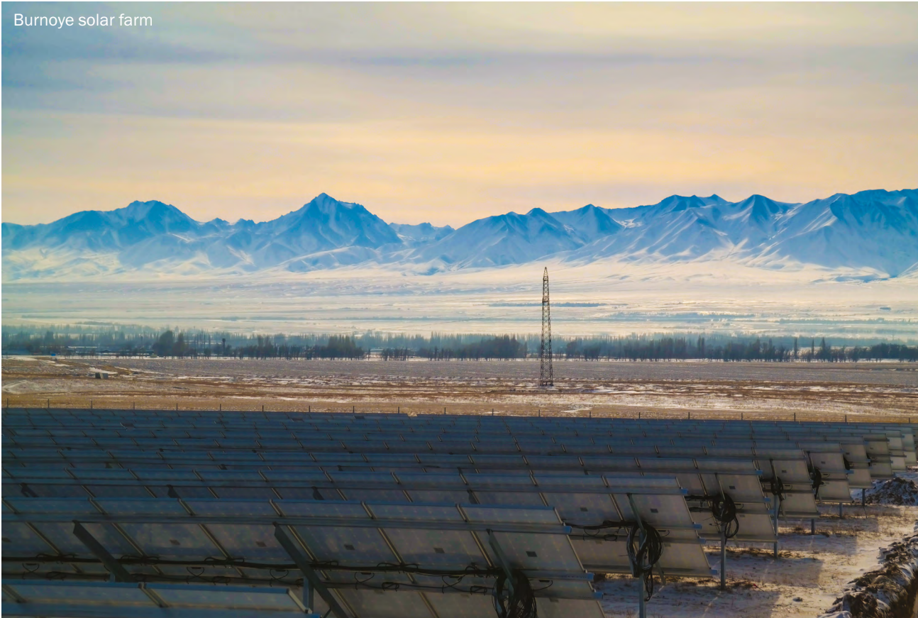
Burnoye solar farm