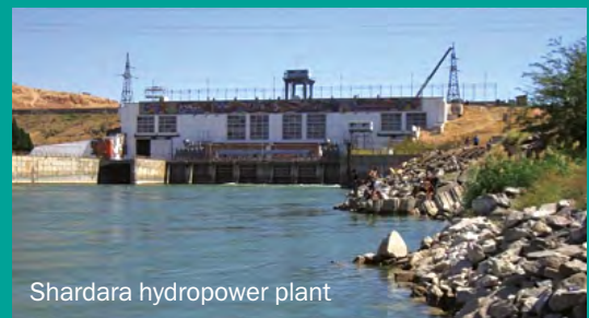
Shardara hydropower plant

This project is estimated to result in increased output of at least 30 per cent to more than 650,000 MWh per year, substituting part of the thermal power imports from coal power plants in the north. The savings are estimated to be around 875,000 tonnes of CO 2 per year, excluding the avoided transmission losses.