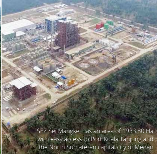
SEZ Sei Mangkei has an area of 1933.80 Ha with easy access to Port Kuala Tanjung and the North Sumateran capital city of Medan