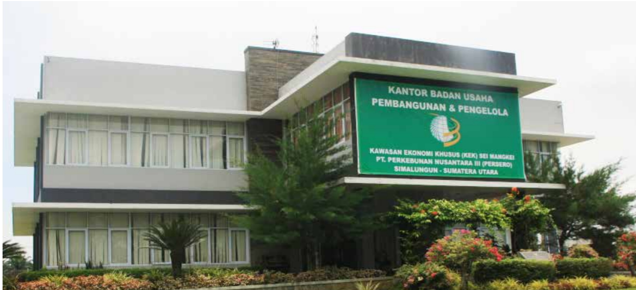
SEZ Sei Mangkei development and management office in Simalungun

SEZ Sei Mangkei is divided into 3 zones: industrial, logistic and tourism zones