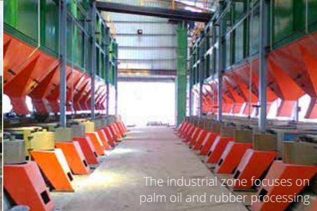
The industrial zone focuses on palm oil and rubber processing

The SEZ will be developed as a satellite city supporting logistical and tourism activities