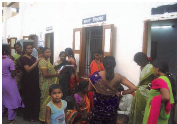
Single window clearance for effective redressal of complaints

Establishing a centralised citizen grievance redressal system is a very effective mechanism to improve service delivery. All citizens should be able to lodge complaints about any municipal service and the complaint should be responded to in an agreed time period, as specified in the citizen charter. The complaint could be made over phone (on a toll free number), online or in writing. The compliance report should be assessed by the higher level officers in the ULB. Numerous ULBs such as Surat Municipal Corporation and Rajkot Municipal Corporation have implemented efficient grievance redressal systems. Few ULBs have begun to receive