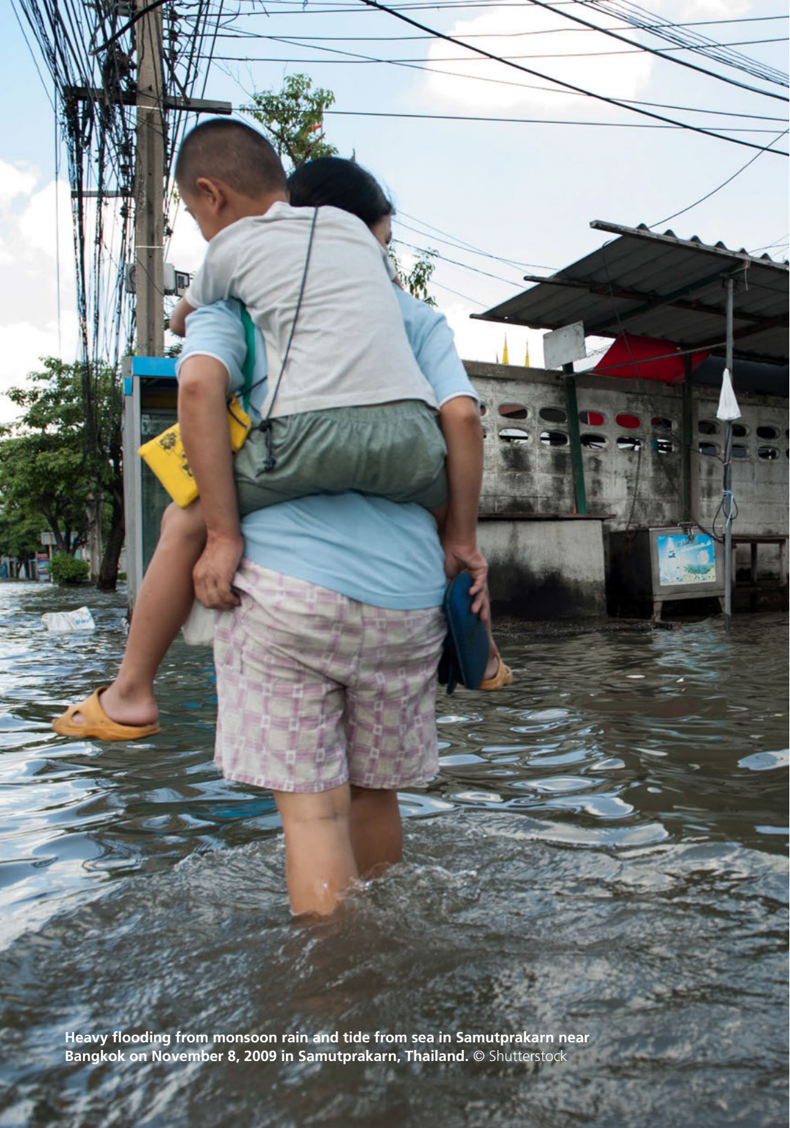
Heavy flooding from monsoon rain and tide from sea in Samutprakarn near Bangkok on November 8, 2009 in Samutprakarn, Thailand.