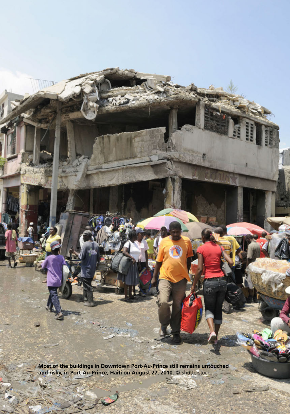
Most of the buildings in Downtown Port-Au-Prince still remains untouched and risky, in Port-Au-Prince, Haiti on August 27, 2010.