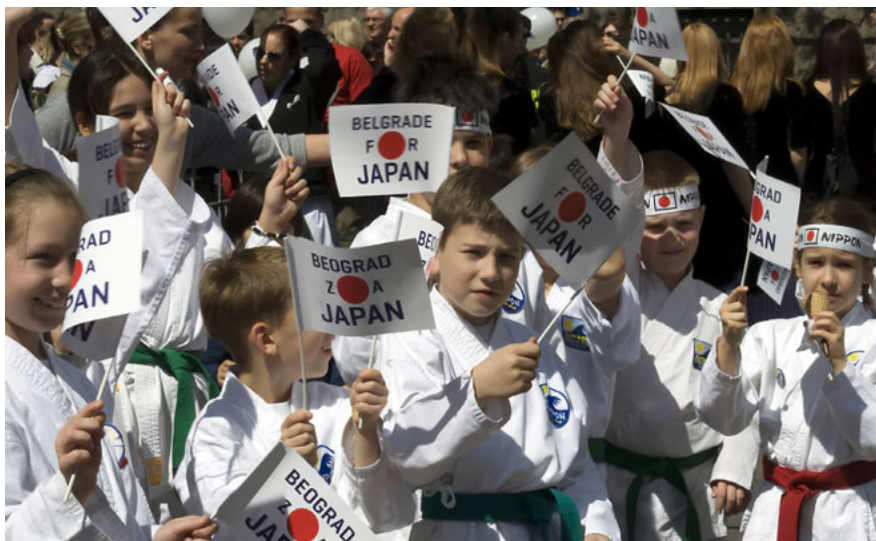
"Belgrade for Japan", Support for the people of Japan after the earthquake and tsunami in Belgrade, Serbia.

Source: UN-Habitat "Gender in Local Government - A Source Book for Trainers" page 19.