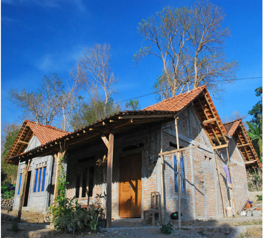
A house designed to meet technical specifications to reduce risks from earthquakes. Yogyakarta, Indonesia.