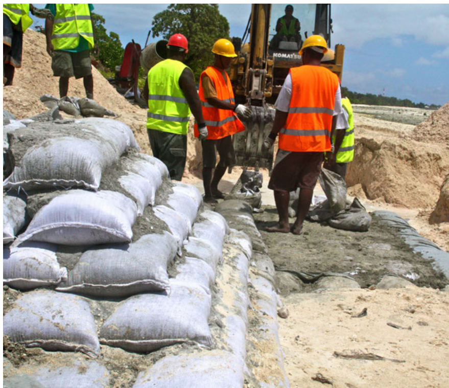
Building Seawalls. Tarawa, Kiribati.