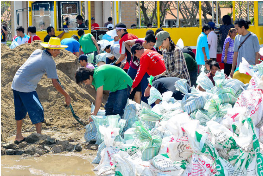
Thai people making sandbags to prevent flooding during the monsoon season in Bangkok, Thailand.