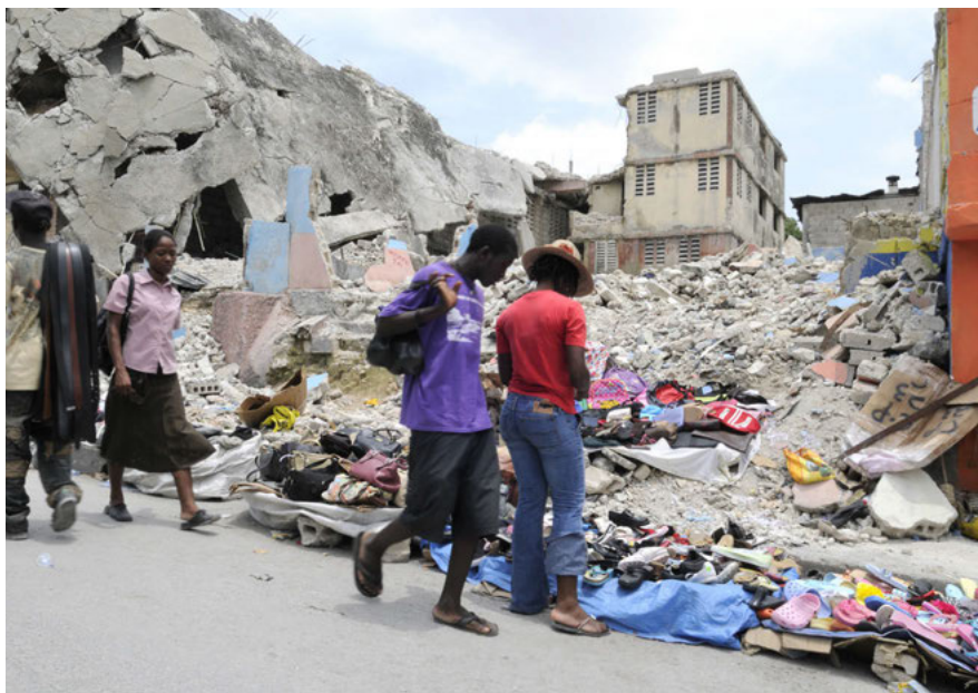
People buying and selling stuffs in front of a collapsed building in Port-Au-Prince, Haiti on August 21 2010.

This issue guide focuses attention on Urban Risk Reduction and Rehabilitation in order to broadly outline the where and how of gender responsive interventions to strengthen planned and future actions to advance gender equality and women's empowerment.