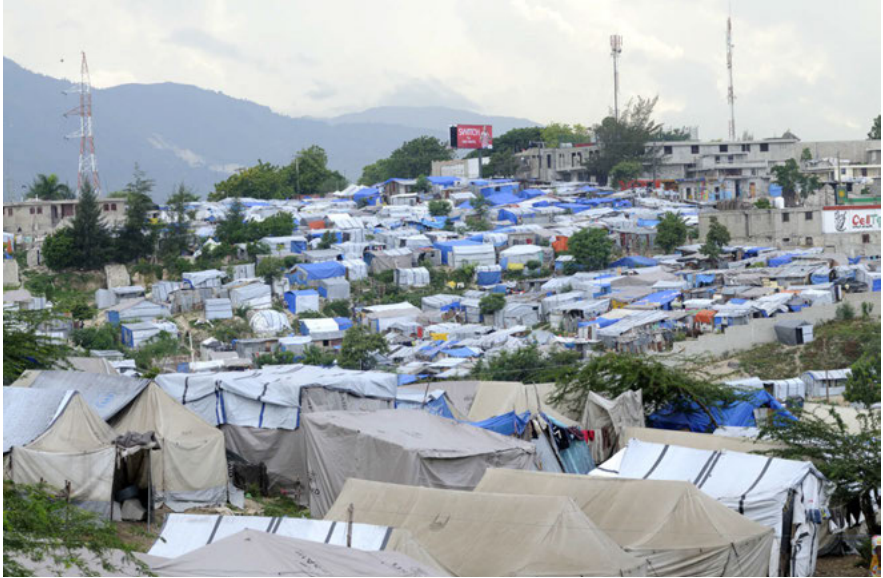
A big Tent city for the Victims of the earthquake on August 28, 2010 in Port-Au-Prince, Haiti.