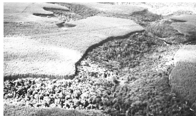
Example of Veracel's landscape management mosaic meshing plantations and natural forests

Among the key obstacles to adequate funding, investment, and other economic incentives for conservation are: limited human and financial resources; constraints on institutional capacity; uneven distribution of costs associated with conservation investments; lack of international rules allowing market trading of forest-based carbon offsets; certain regulatory provisions contrary to maintaining and enhancing endangered species populations; limited consumer demand for certified forest products sold at premium prices; tax policies unfavorable to sustainable forest management; and lack of a common vision for allocation of resources to high priority areas. Although "win-win" solutions are within