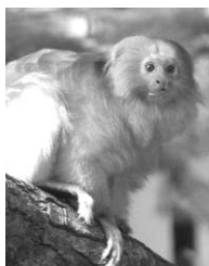
Golden Lion Tamarin

Pressures are mounting on the world's forested land base to meet society's needs for wood and paper products. At the same time, scientific understanding and public concern is mounting over the biodiversity impacts of global forest destruction. Deforestation trends are particularly acute in the tropics, where only about 45 percent of the world's original extent of tropical rainforest currently remains, and these forests are being lost at a rate of about one percent per year.