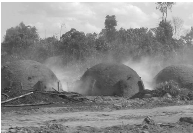
Roadside charcoal mounds

Meeting participants agreed that creative thinking and a willingness on all sides to try different approaches can help break through traditional "gridlock" and produce outcomes satisfactory to all stakeholders. There is a need to devote time and attention to building trust and capture lessons from successful collaborative processes that have yielded measurable conservation outcomes. Consensus recommendations coming from diverse stakeholder alliances can be influential in shaping policies that are beneficial to business and biodiversity, and in supporting politically favorable outcomes.