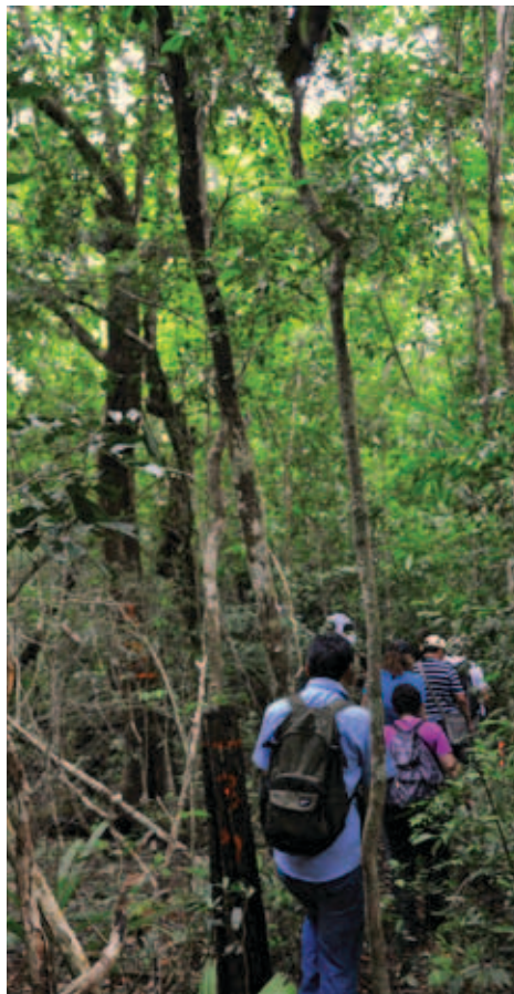
Participants enter Ejido de Felipe Carrillo Puerto forest

As observed over the two-year dialogue process, where local capacity is strong, national governments can enable local stakeholders to design their own REDD+ benefit-sharing mechanisms. Most critically, this begins with identifying the specific beneficiaries while providing general policy guidance to ensure national or subnational consistency. Where local capacity is weak, capacity building could be perceived as an interim benefit of REDD+ processes if it empowers local communities, women and Indigenous Peoples to play a greater and sustained role in decision-making through multi-stakeholder forums. Ultimately, such forums will help ensure the longer-term societal outcomes of increasing rural incomes while ensuring permanence in emissions reductions.