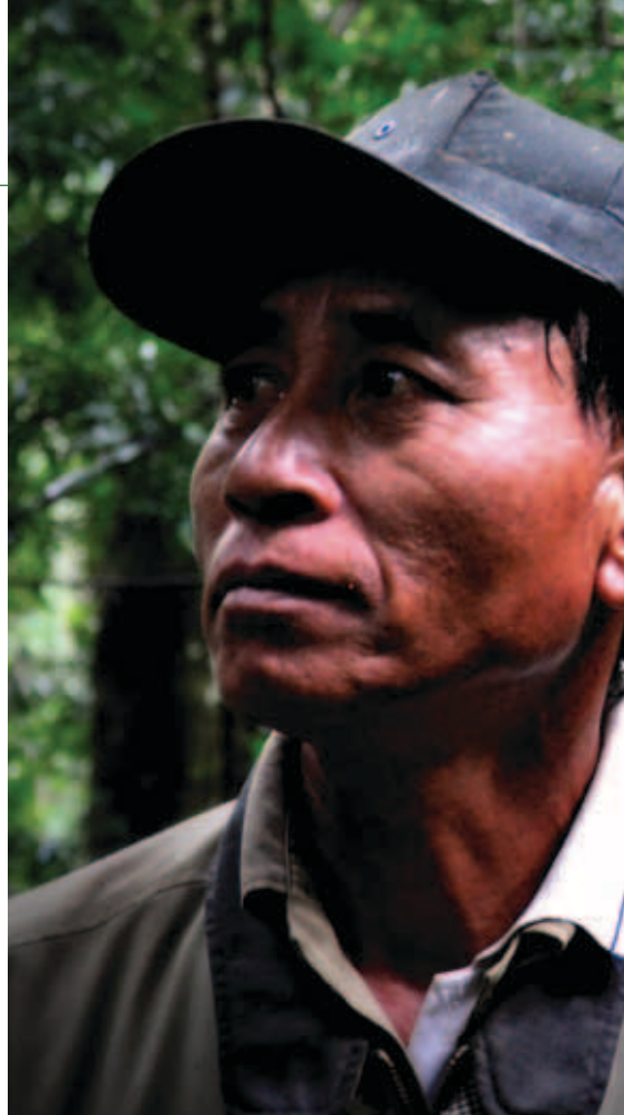
Grung Re community member explains forest protection strategies.