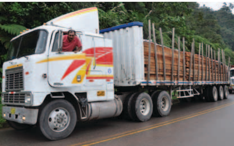
Transporting timber near Moyobamba, Peru

The 182 000-hectare Alto Mayo Protected Forest (BPAM) in Peru is of high value for biodiversity conservation and watershed protection. Despite its designation as a protected area, however, it has one of the highest rates of deforestation of any protected area in Peru.