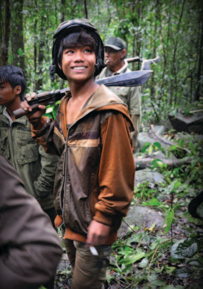
A young forest guard in Viet Nam