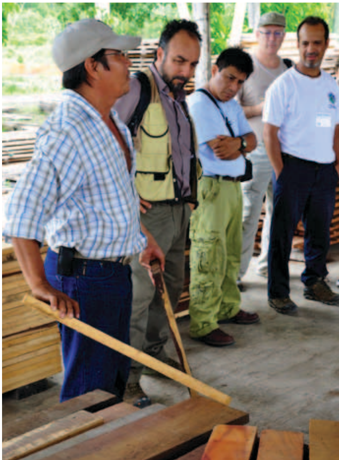
A community member of Ejido Noh Bec explains an aspect of sustainable timber production to dialogue participants