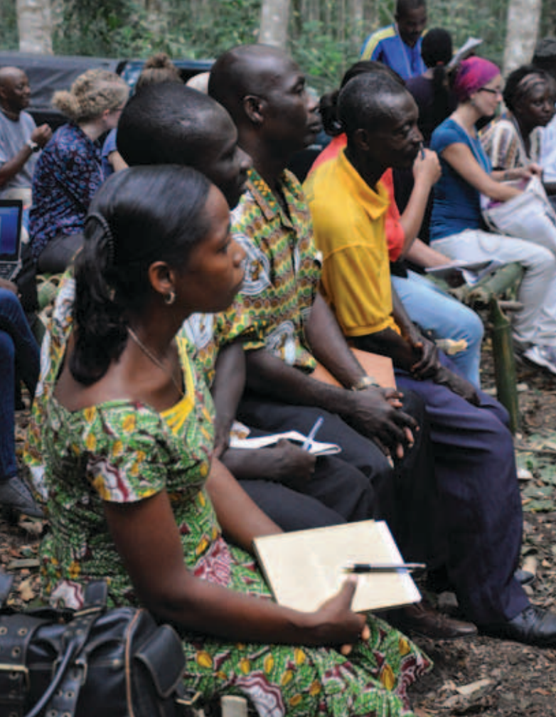
Community members at Portal Limited