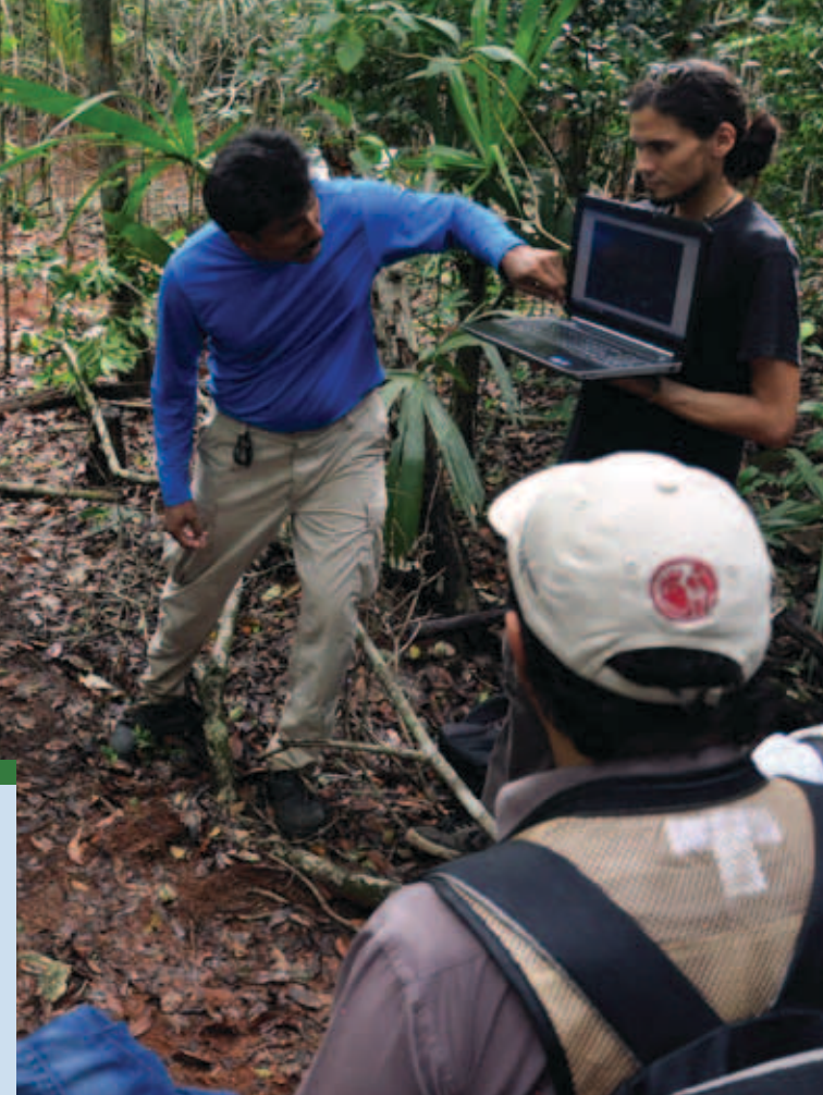
Participants learn about Ejido de Felipe Carrillo Puerto carbon accounting

While it is broadly accepted that REDD+ benefit-sharing should be effective, efficient and equitable (the “3 Es”), tradeoffs among these three principles are inevitable in practice. Optimal outcomes of REDD+ benefit-sharing are unlikely to maximize any one of the 3E principles. The decision-making process on how compromises among the 3Es are made is vital for ensuring the legitimacy of REDD+ benefit-sharing.