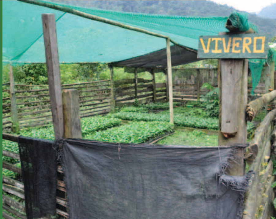
A tree nursery at Aguas Verdes

At the subnational level, both performance-based and input-based approaches can be used to share the cash and non-cash benefits of REDD+. A national government can set up frameworks, employ safeguards, and provide options for sharing benefits, but the types of benefits shared and the basis on which such sharing takes place must be tailored to local circumstances. Each eligible land-use activity in REDD+ may require its own set of incentives and thus its own mechanisms for providing those incentives. Traditional and customary laws can be helpful in designing benefit-sharing mechanisms.