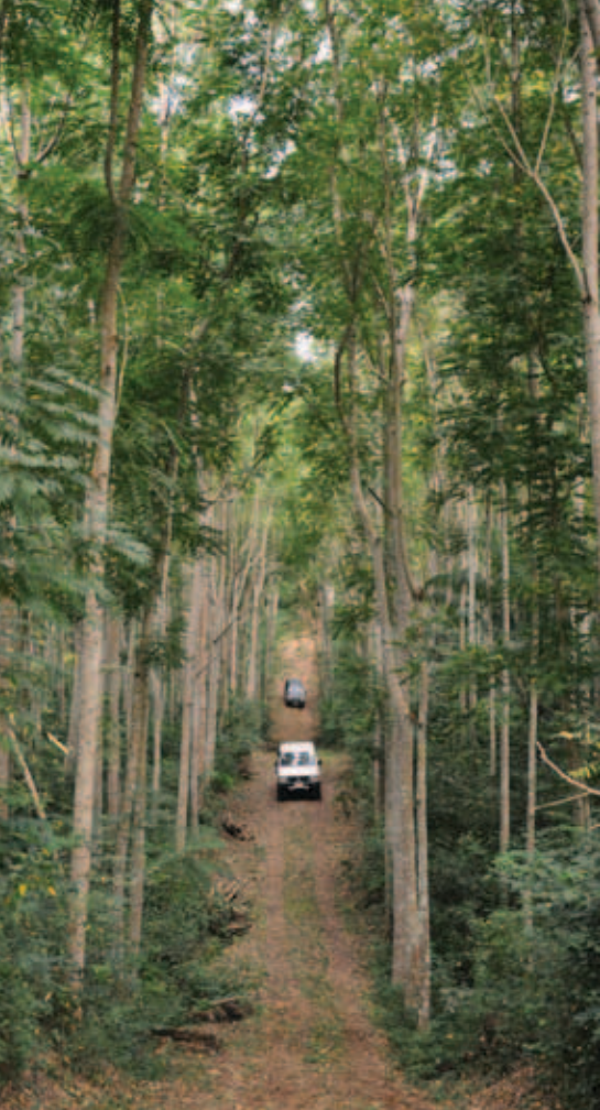
Participants enter Portal Limited