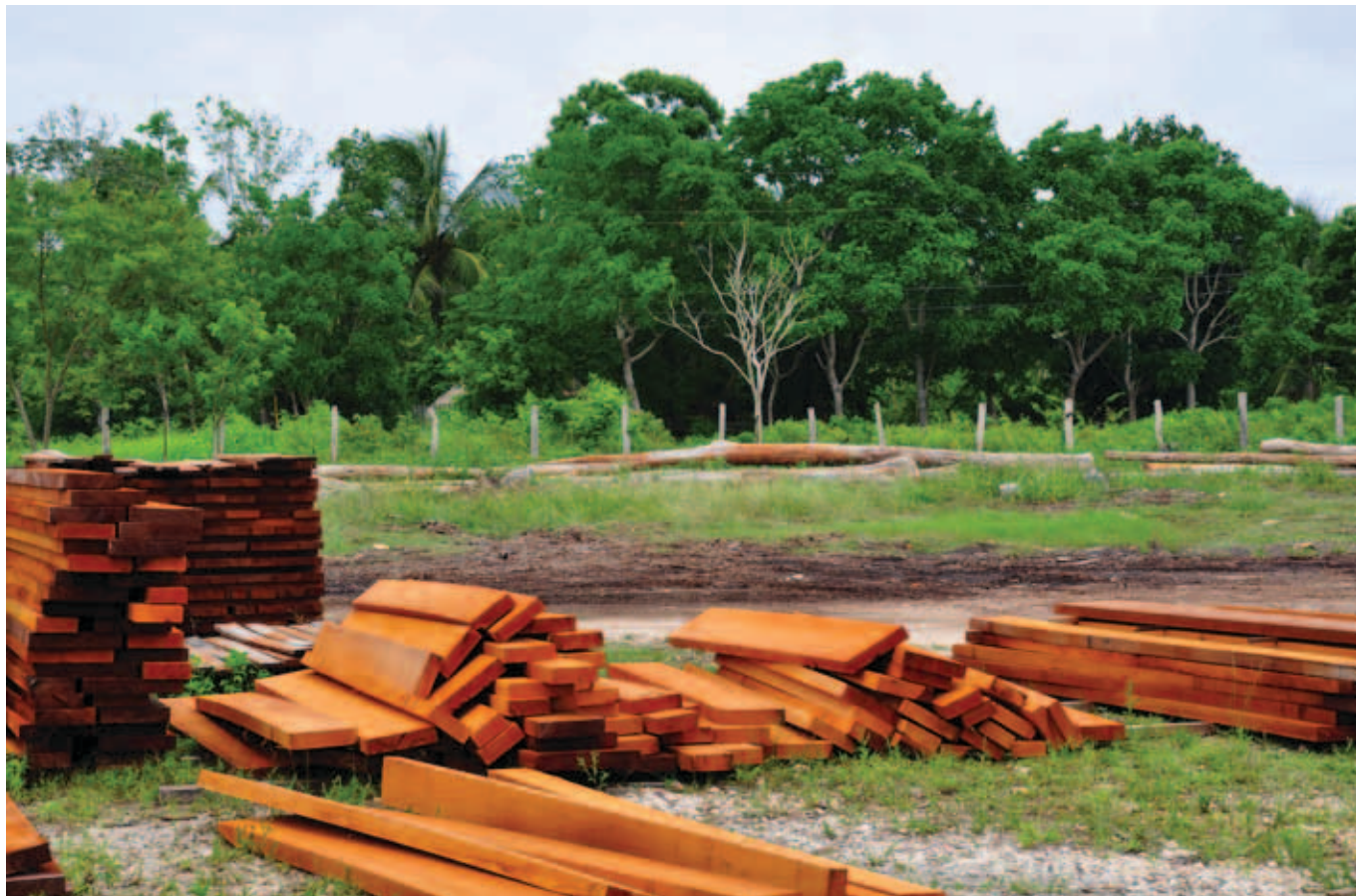
Timber produced by Ejido Noh Bec , Mexico