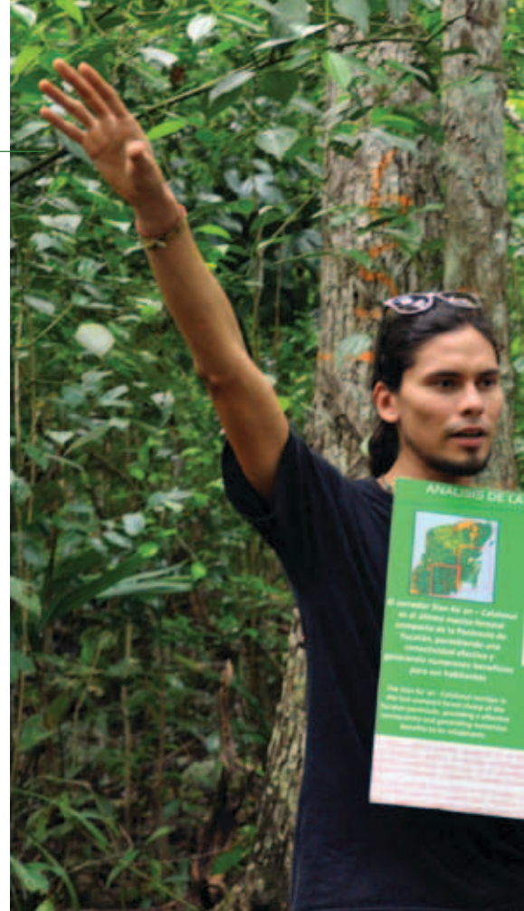
An Ejido de Felipe Carrillo Puerto community member explains deforestation trends

Local stakeholders can develop their own investment plans for reducing deforestation and degradation. In such plans, local stakeholders can also define who the beneficiaries will be and how the benefits will be shared. Multi-stakeholder committees will be formed at the state level to select investment plans based on state REDD+ strategies, guided by the federal government. A safeguards system will be put in place at all levels to guide the development and implementation of investment plans, government policies and benefit-sharing.