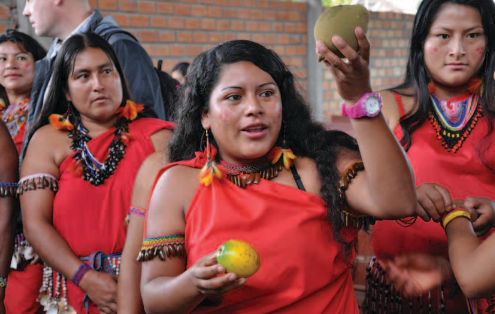
Women of the Shampuyacu community educate participants about local fruits