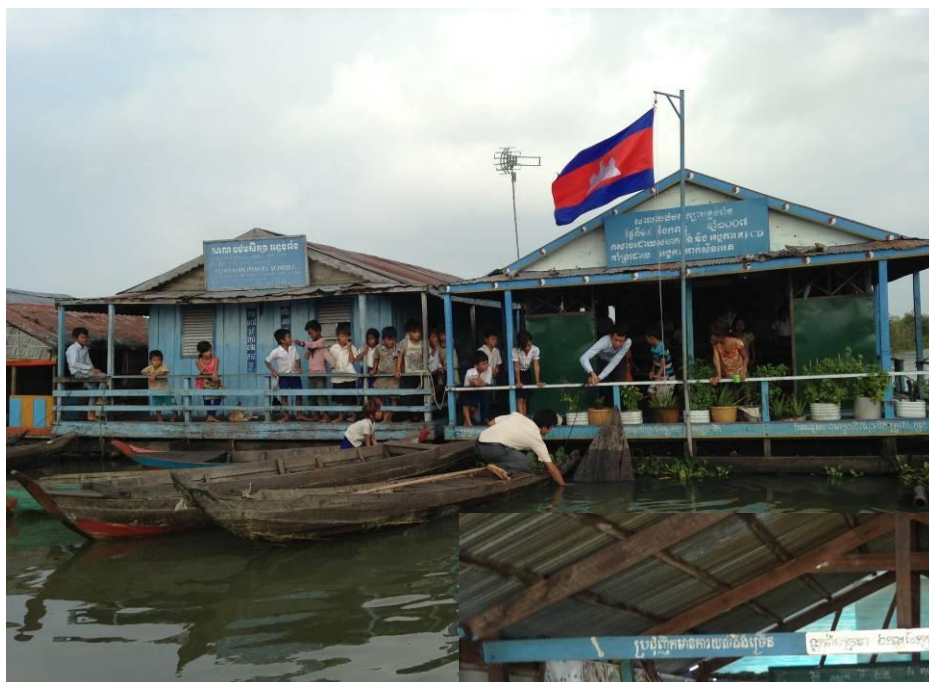
Pursat and Kampong Chhnang Provinces

Environmental Safeguards documentation preparation Social Assessment and Community Consultations