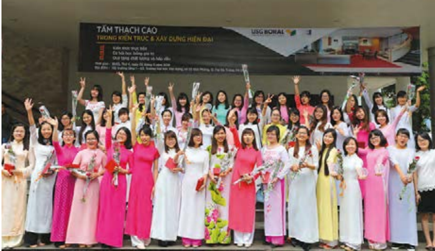
The graduation ceremony of the Merali Scholars' first cohort in Vietnam at the National University of Civil Engineering