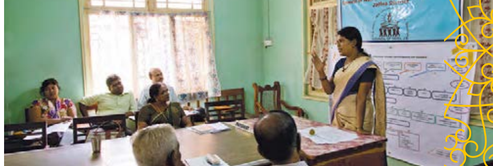
Counselor meeting with Children and Women's Bureau staff in Sri Lanka