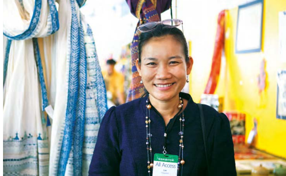
The Santa Fe International Folk Art Market brought Asian women artisans into the global marketplace.