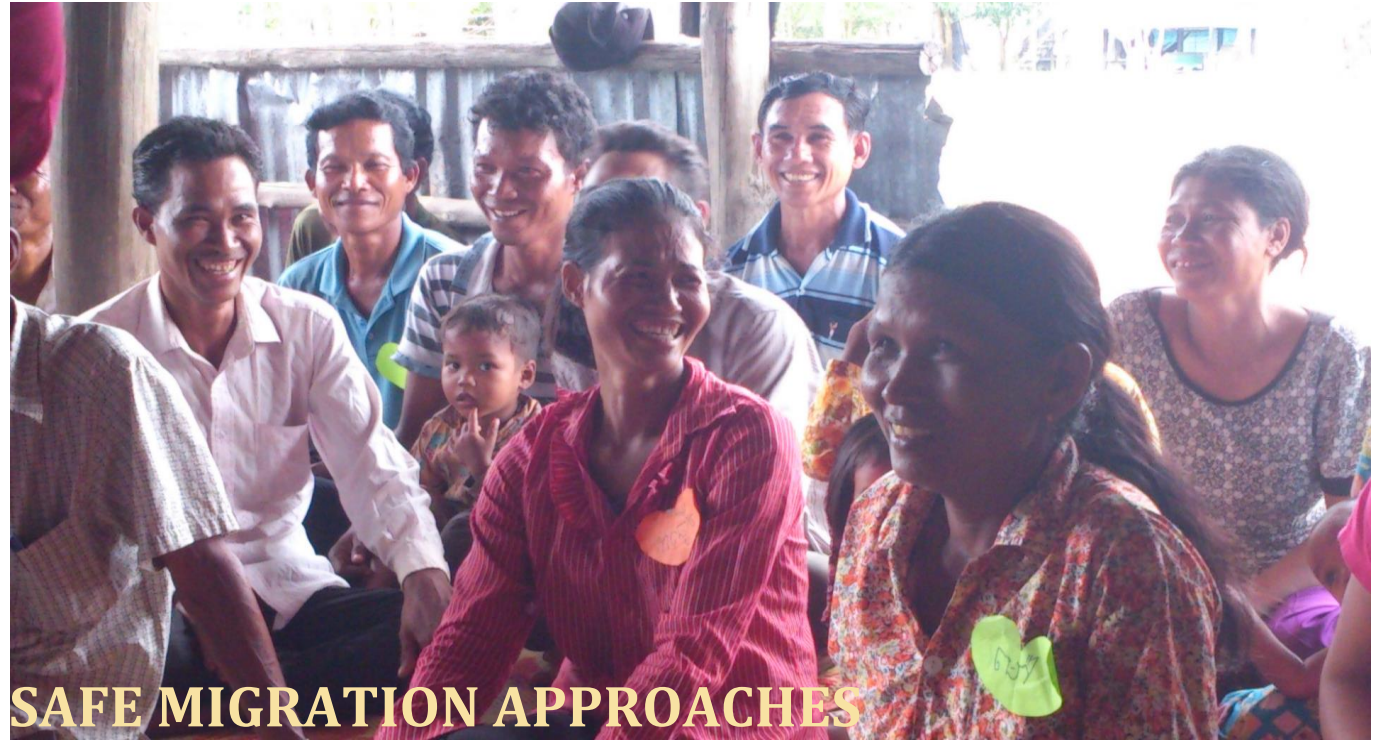
TO PROMOTE SAFE MIGRATION FOR MARGINALISED RURAL WOMEN