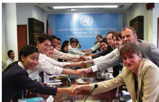
Launch of UN Youth Advisory Panel December 18, 2007

It is early in Cambodia's modern era to find substantial examples of youth participation, interpreted here to mean institutionalized participation of youth in formal structures. The concept is only just being introduced into the development sector and has yet to reach the other sectors of society. At a very basic level, YCC is promoting youth participation by encouraging young volunteers to attend commune council meetings. Exposing councilors to concerned and thoughtful youth is a first step in raising the profile of youth as civic actors. Making short-term