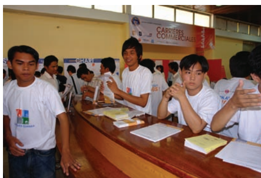
Career Forum 2007

Recently, the National University of Management agreed to introduce a survey course offered by GIPC. Presented as a reading seminar, it was the first university-level course on the garment industry. Full enrollment in the course and growing student interest in potential employment has since spurred four institutions (Norton, RUPP and UOC and