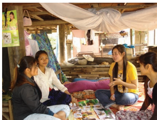
Adolescent Reproductive Health

Empirical research has not had time to fully document emerging patterns, but the first indications are there. For example, in the first 168 proposals that commune councils submitted to the Pact Local Administration and Reform project for social development activities, 13 requests (8%) are to address problems with youth, youth violence and substance abuse. There is no observable geographic or other pattern associated with the requests, which originate in different areas. In a society where youth have not historically taken center stage, the number of requests for youth-related projects and their widespread distribution can only signify a national trend that is not limited to urban areas. It is hoped that the findings of the UN Country Team Youth Situation Analysis will establish a clearer picture of what is taking place.