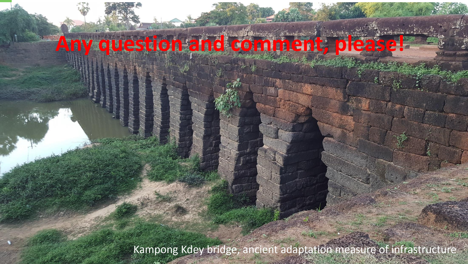
Kampong Kdei bridge, ancient adaptation measure of infrastructure