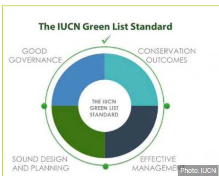
Figure 1: Four components of the Green List Standard

There are four main components to the Green List Standard – (1) good governance, (2) sound planning and design, (3) effective management, and (4) conservation outcomes (see Figure 1).