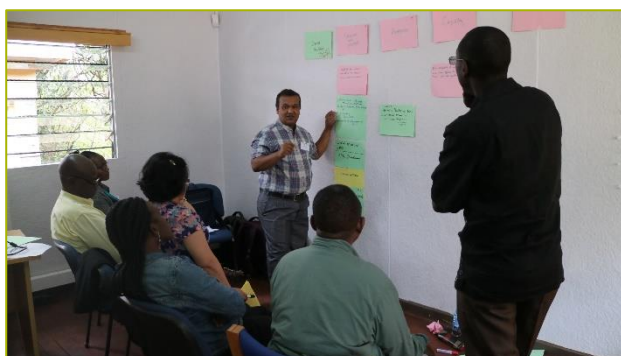
Group exercise on understanding the good governance principles