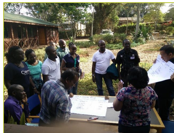
Participants planning and reflecting on governance assessment processes