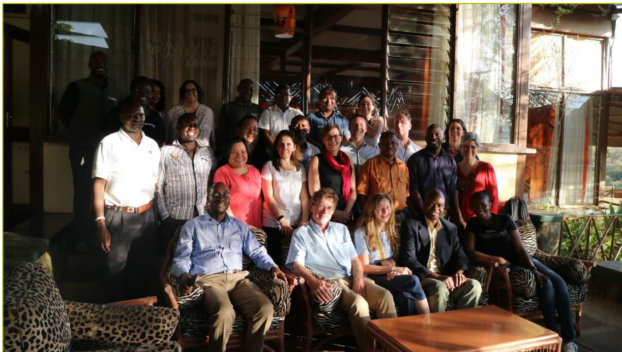
‘Governance, Equity and the Green List’ workshop participants on days 1 and 2