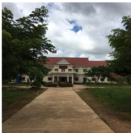
Entrance to Preah Reaj Por Chanyeakech High School

Although science and math teachers are engaged in private teaching, they agreed to stop if MoEYS provided an incentive. In view of these operating conditions, the school has a high probability of resulting in successful NGS investment.