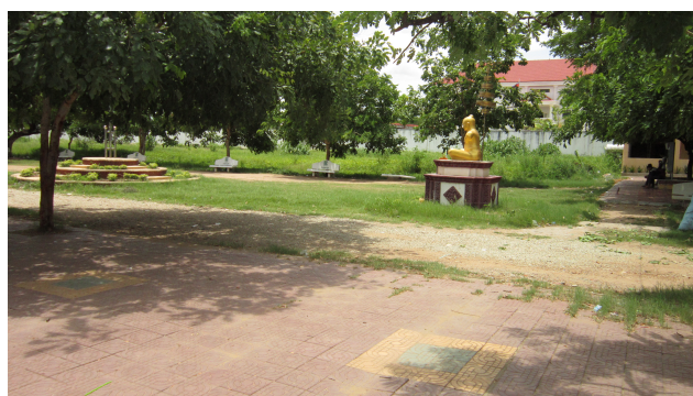
Courtyard at Prek Anchanh

Given the disappointing results at the above schools, the POE suggested a visit to Prek Anchanh HS , which is in a semi-urban location on National Highway 6a. Teachers at this school appear to be relatively young and seemed very welcoming of NGS establishment, as did all school managers. The school seems to have close cooperation among its managers and very low incidence of private classes. The community is also very supportive of the idea of NGS investment and made a strong commitment to making systematic contributions if educational standards improved. School infrastructure is also in solid condition and would