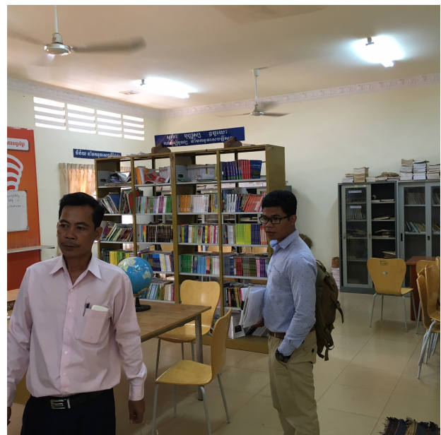
Library at Hun Sen Suang HS