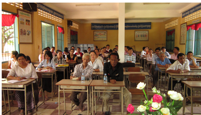
Teacher meeting at Prek Leap HS

The other school nominated by the POE as a potential NGS site was Prek Leap HS , which is also located on National Highway 6a. This school seemed to have a very low incidence of private teaching and the few teachers that were engaged in such activities indicated that they would be willing to stop if an incentive were provided to them. The school managers are very young and imaginative and expressed high excitement that their school could be an NGS site. The community also welcomed the idea and promised significant outside support from philanthropic patrons to help Ministry pay for supporting the school. Prek Leap HS, therefore, seemed to have somewhat more potential than Russey Keo HS though the latter could still be considered for expansion if additional investment resources become available.