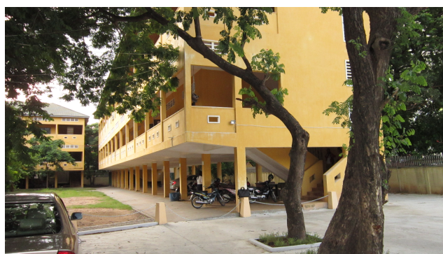
Classroom at Boeung Keng Kang HS

The Municipality of Phnom Penh nominated three schools for consideration as NGS sites. One of these ( Boeung Keng Kang HS ) was a very troubled school where the former school director was recently removed due to bitter conflicts with teachers over issues of money and private classes. A new school director who appears competent has been given the difficult task of trying to rebuild consensus at the school.