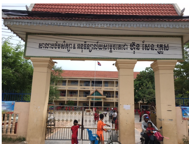
Table 3.16: Overview of Angkor High School (Failed Desk Review)

Of the three high schools nominated by the POE of Siem Reap, two ( Angkor HS and 7 Makara HS ) were disqualified at the desk review stage because of their huge size and reports of wide-scale private teaching. Schools of this character depart significantly from guidelines provided to POE representatives during the NGS orientation because they present many challenges to successful NGS investment.