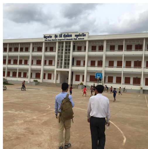
New building constructed by Prime Minister at Amphoe Wan HS