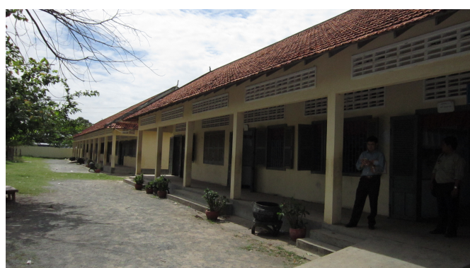
← Classroom buildings at Tee-rom Ket High School