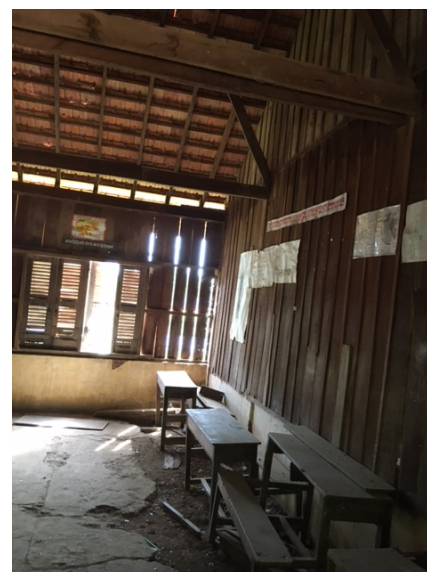
Classroom at Oramal LSS

The Provincial Office of Education nominated two existing lower secondary schools as potential NGS sites. Although both were relatively small schools with fewer than 500 students, a desirable trait for an NGS site, Oramal LSS was clearly the weaker school because of its poor management, the likely resistance from teachers to stop private classes, and the significant investment that would be needed to revamp the school's infrastructure, which is considerably run down. On the other hand, Wat Kor LSS seems to have strong community support as well as much more dynamic school leadership, leading to strong advocacy for upgrading the school's infrastructure. While additional investment would still be needed in the school's infrastructure, this would clearly be much less than required at Oramal LSS. In addition, the teachers at Wat Kor LSS appear to be much more receptive to accepting NGS teacher professional code and are not strongly wedded to their private classes.